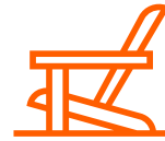
Sit a Spell