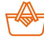
Share a Picnic