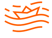
Play in the Water