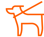
Bring Your Dog