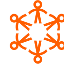
Gather in a Circle