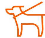
Bring Your Dog