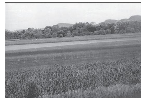
The Great Meadow.

The fact that this historic area has been farmed continuously for more than 350 years is a testimony to the good stewardship of the landowners and farmers who tend to the land. However, the future of Great Meadow may be in jeopardy. For the first time, some of this land is being valued more for its development potential than for farming. The Kestrel Trust is concerned that